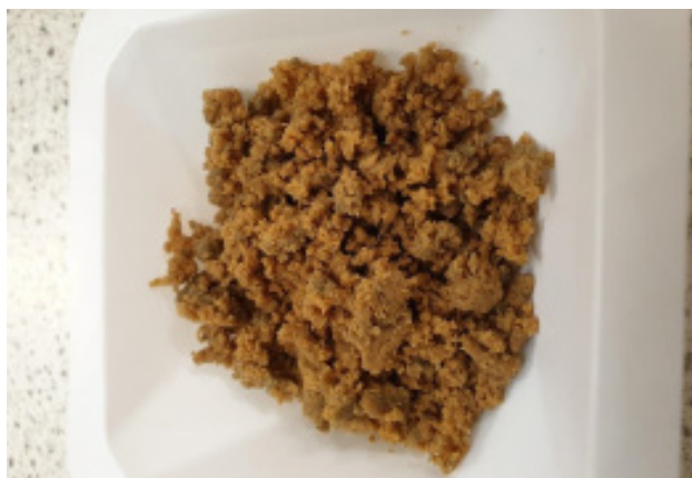
Figure 1: The product Curran® extracted from by-products of the sugar industry.

Curran® is a complex hierarchical natural structure containing natural polymers, including cellulose, in the form of micron sized platelets. Each platelet is formed from interwoven cellulose nanofibers embedded in non-crystalline polymers. For bio-based materials, like Curran®, which are usually weak X-ray scatterers, in combination with structures at different length scales, lab-based X-ray sources are not optimal suited.